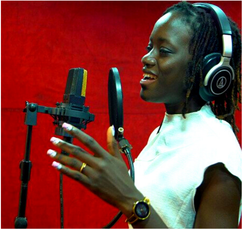
SENEGALESE GIRLS USE HIP HOP TO PUSH FOR POLITICAL CHANGE