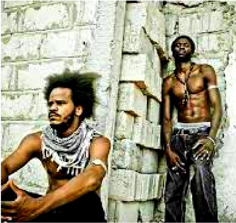
SENEGAL'S RAPPERS CONTINUE TO "CRY FROM THE HEART" FOR A MORE JUST SOCIETY